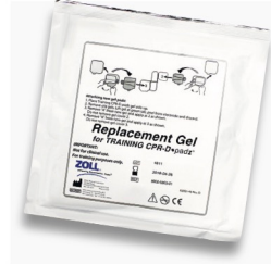
Replacement Adhesive Gels for CPR-D-padz Trainer Electrodes Part# 8900-0803-01

(Replacements must be ordered separately)