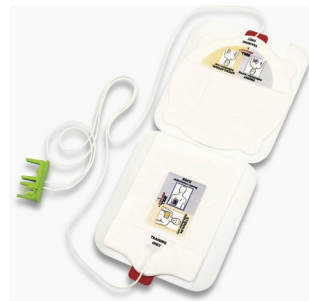
Stat-padz® II Trainer Electrodes Part# 8900-0805-01 (case of 6)