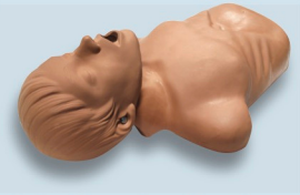
AED Plus Trainer Demo Manikin Part# 8000-0835-01