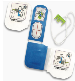
CPR-D-padz Trainer Electrodes Part# 8900-0804-01