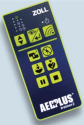
AED Plus Trainer2 Replacement Remote Part# 8008-0007