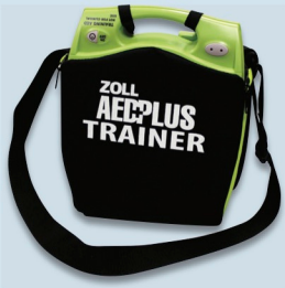
AED Plus Trainer Carry Case Part# 8000-0375-01