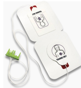
Pedi-padz® II Trainer Electrodes Part# 8900-000861-01 (case of 6)